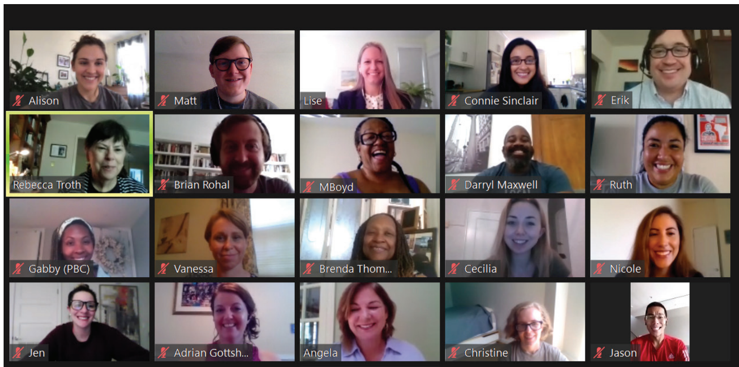
Pro Bono Center staff gathers on a teleconference for a staff meeting.