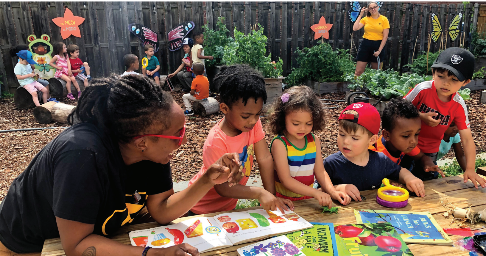
Early in the pandemic, City Blossoms, an organization dedicated to developing kid-friendly green spaces, gained valuable insight to guide its future through a consultation with the Pro Bono Center's Nonprofit Legal Assistance Program.